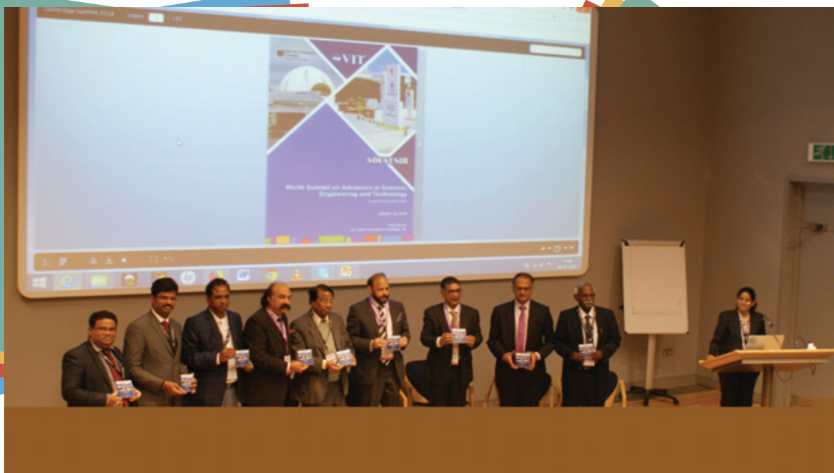
The World Summit on Advances in Science, Engineering and Technology, a prestigious three-day event, was organized by Vellore Institute of Technology at Murray Edwards College, University of Cambridge, United Kingdom on January 4, 2018.