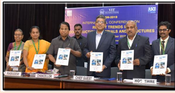
International Conference on "Recent Trends in Construction Materials and Structures" -Sept-2019