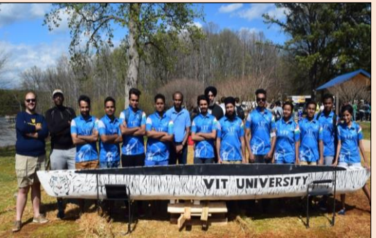
ASCE Students ('Team Eklavya) for ASCE Canoe Competition